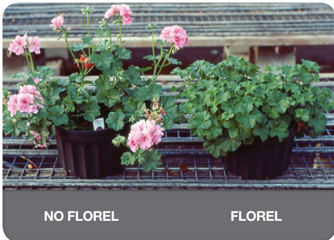
Multiple Florel applications showing maximum branching.