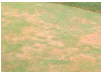
Left untreated, Pythium turf diseases can kill large areas of turf within a matter of days.