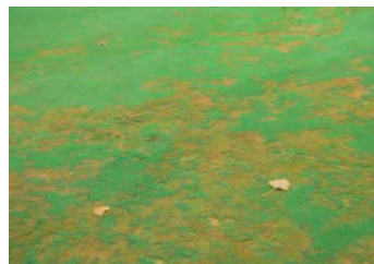
Orange colour and irregular pattern of symptoms associated with Pythium Blight on cool-season turf.